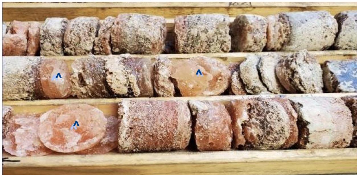
Drill Hole: BSW-06-04 (somewhere between 567.05 to 557.8 m), ^ identifies salt beds.

"These are essential claims to SourceRock as their previous drill holes demonstrate that we are within a high-pressure sedimentary basin with very high salinity. However, lithium was not a marketable commodity when these drill holes were completed and thus never analyzed in either the fluids or the rocks. Metal Energy now controls a dominant land position covering the deepest parts of the basin. All the pathfinder elements and multiple supporting documents suggest high lithium concentrations are probable. SourceRock is permitted to drill, and we believe a few drill holes can assess the geologic validity of our thesis," said James Sykes, CEO of Metal Energy.